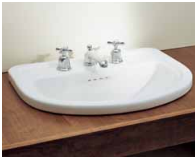
Shown with Archive faucet (5414.801)