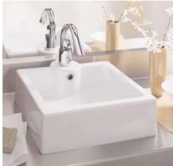
Shown with Iperbole faucet (5131.101.002)