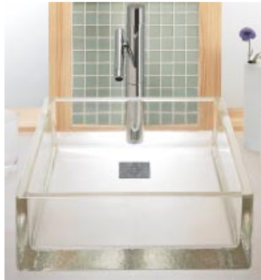
Shown with Alfiere® faucet (5415.501.002)