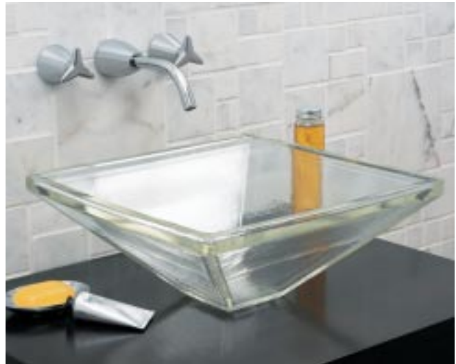
Shown with Stemma faucet (5339.451.002)

Fixture Dimensions conform to ANSI Standard A112.19.2M